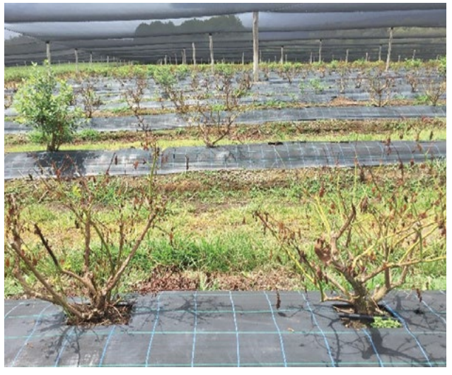
Figure 4. Blueberries do not tolerate high salinity irrigation water.

Table 2 provides a summary of the ranges for specific water quality parameters and the levels of salt, chloride, iron and pH that are applicable when irrigating blueberries.