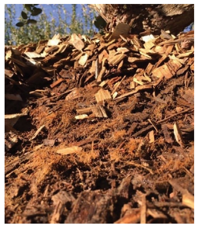
Figure 3. Mulch will reduce evaporation from the topsoil as well as provide protection from erosion.

Table 1. A comparison of the main soil and substrate moisture monitoring systems.