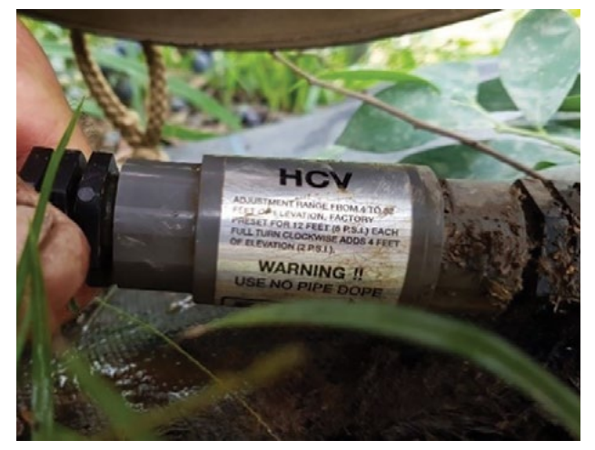
Figure 1. Check valves can reduce the drainage from mains to the lowest dripper.

This will ensure the pressure compensating (PC) drippers can effectively meter out the same volume to every plant being irrigated.