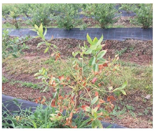
Figure 5. A blueberry plant showing early signs of suffering from salinity.