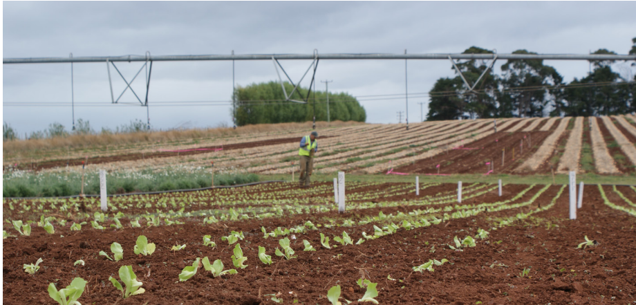
Image 2: To ensure the efficacy of calcium cyanamide, make sure that you follow the guidelines specific to the crop that you are growing