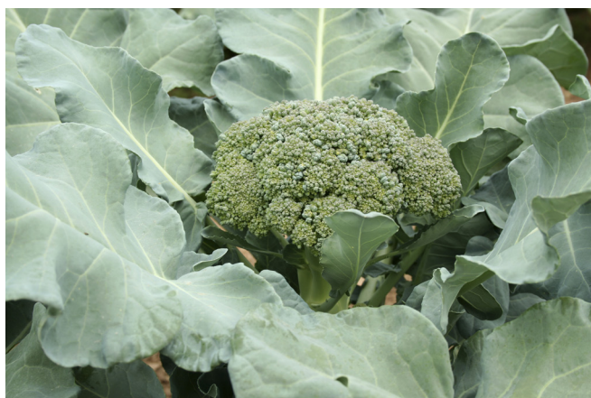
Image 1: Calcium cyanamide provides control of soil-borne diseases, newly germinated weeds, and assists with residue breakdown when applied as a fertiliser

Calcium cyanamide when used as a fertiliser, offers good control of clubroot and some species of Phytophthora. Other organisms causing soil-borne diseases may also be affected. Recent trials in carrots have shown a decline in levels of Pythium sulcatum. Research has shown large differences in sensitivity of soil-borne pathogens to calcium cyanamide, therefore it cannot be considered a soil fumigant. A soil fumigant is a product that has a broad spectrum, destructive effect on soil life, including pathogens and on germinating seeds, including weeds.