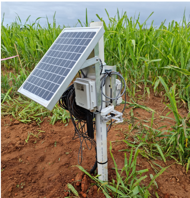
Soil moisture sensors with communications node