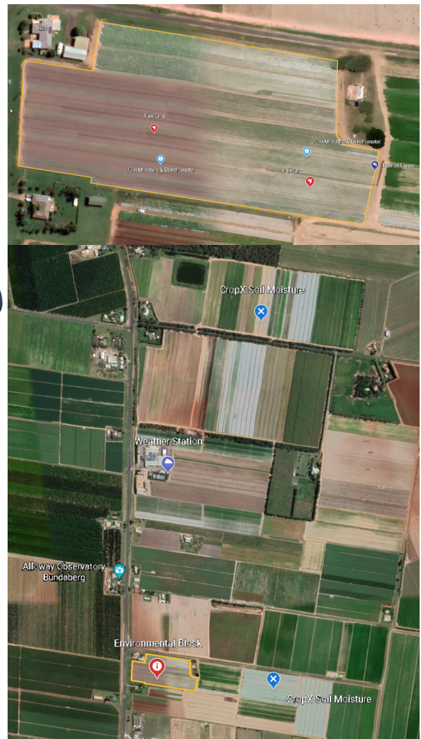
Environmental Block map