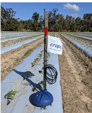
CropX soil moisture sensor

Crop X soil moisture probes are being trialled at AustChilli. These sensors are preferable to regular soil moisture sensors in short-term crops such as chillies. The Crop X soil moisture probes are easily installed and removed, with minimal soil disturbance. The probe is shaped to behave like a screw, an advantage compared to the unwieldy cables of conventional sensors. This is especially important when monitoring chillies, due to the regular cultivation and rotation involved. The Crop X soil moisture probes will be compared to TDT sensors in this trial.