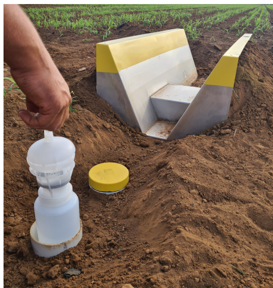
Full Stop leachate monitoring (left)