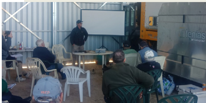
Pistachio growers meet at a Regional Tech Group.

"The PIT groups (Pistachio Information and Technology Groups) have helped with providing information on how best to establish your orchard during this development phase. The industry is quite small so not a lot of research is done, so having the opportunity to get together with other growers and share information complements the more technical information provided by the Pistachio Growers' Association. I've found that everyone is quite open and willing to share."